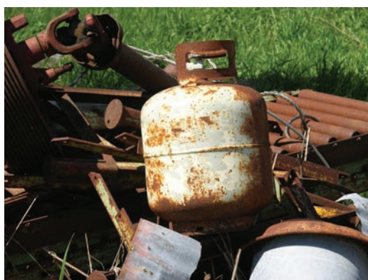
Do not include pressurized containers (e.g. propane tanks) in scrap loads.