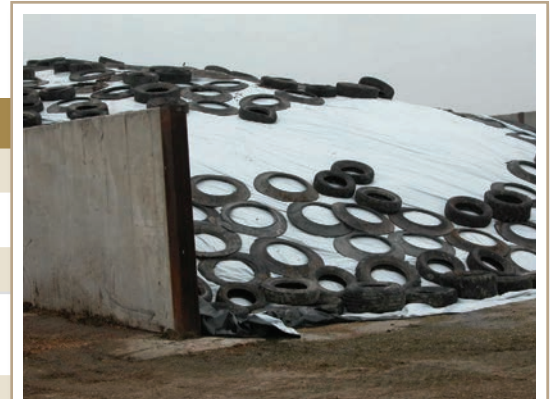
Old tires can be reused for other purposes on the farm such as holding down tarps over feed.

For more information, contact Resource Productivity and Recovery Authority 1-888-936-5513 or www.rpra.ca/programs/tires/