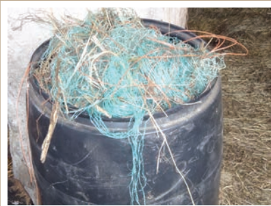
Material that cannot be reused or recycled should be disposed of at an approved landfill site.

For local recycling resources, see the Yellow and Blue pages of your telephone book, under "Wastes & Recycling."