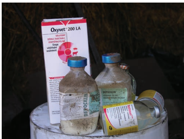
Avoid accumulating quantities of leftover animal health care products. Always keep them in their original containers in an appropriate storage.