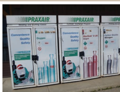
Many retailers accept refillable containers if replacements are being purchased.