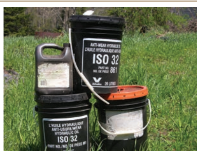
Roughly 50% of the 1 billion litres of lubricating oils sold annually in Canada can be recovered for reuse.