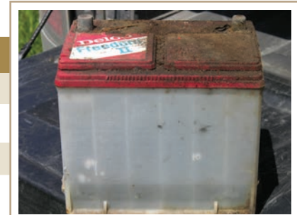
A trade allowance is usually given when purchasing a new replacement battery.