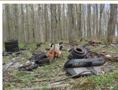
A farm dump can reduce a property's resale value, especially if its contents are unknown or hazardous.