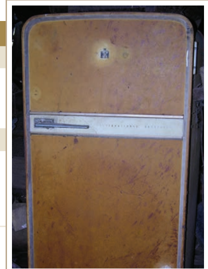
Old appliances may be an environmental and safety hazard.