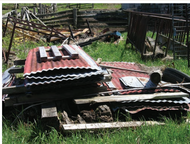
Most uncontaminated building components can be recycled or reused.