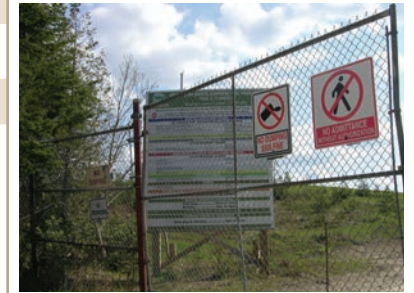
Materials that cannot be reused or recycled should be taken to an approved landfill site for solid non-hazardous wastes, or a Hazardous Waste Depot for hazardous wastes.