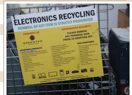
For more information about recycling electronics, and to find a drop site near you, go to: www.recycleyourelectronics.ca .