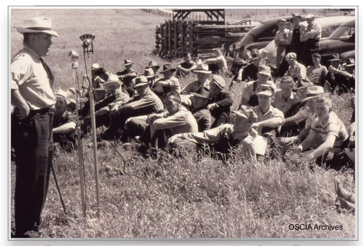
The thirst for new ideas endures. Seek, Test, Hdopt.