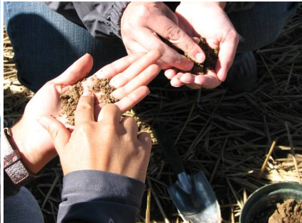
Practicing soil texture determination