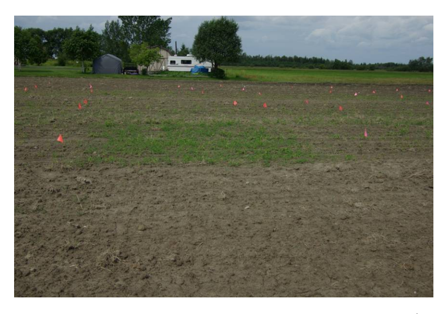
Figure 3: Growth variability among treatments July 25<sup>th</sup>, 2008.

greater than that of the control (Figure 5). Corn growth showed a similar trend, with biomass production being found to be greater in the fertilizer treatment, one fish compost treatment, and the Meeker's Magic Mix<sup>™</sup> treatment when compared to the no addition control amendment (Figure 6).