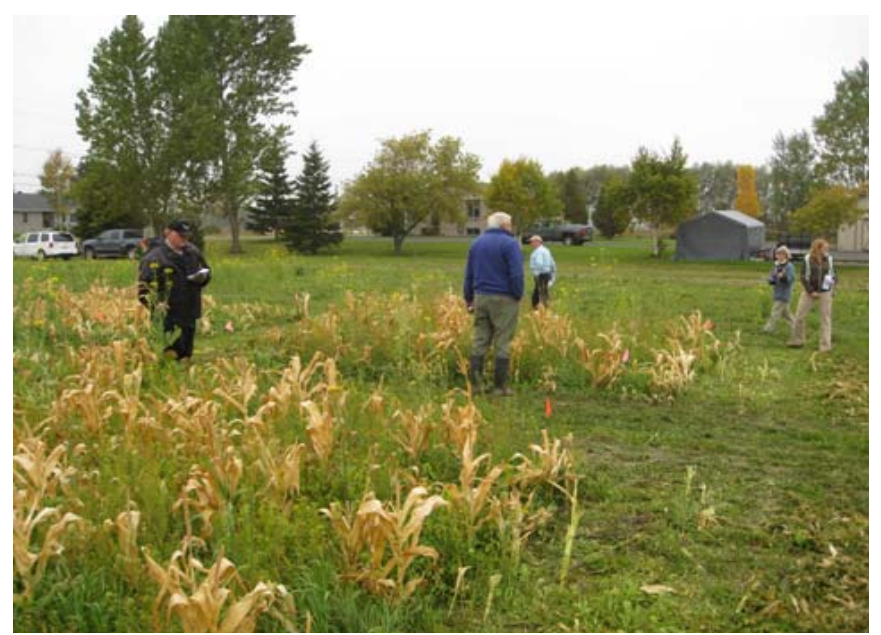
Figure 4: Visual assessment of effectiveness of amendments by local experts and academics.