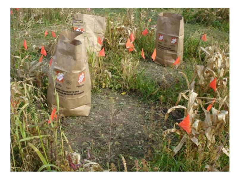
Figure 2: Aboveground biomass collection.