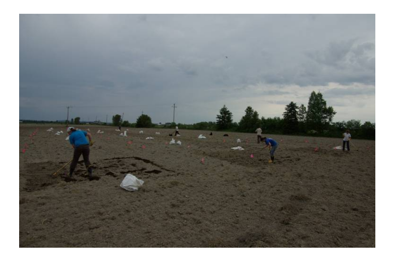
Figure 1: Incorporation of amendments into the soil.