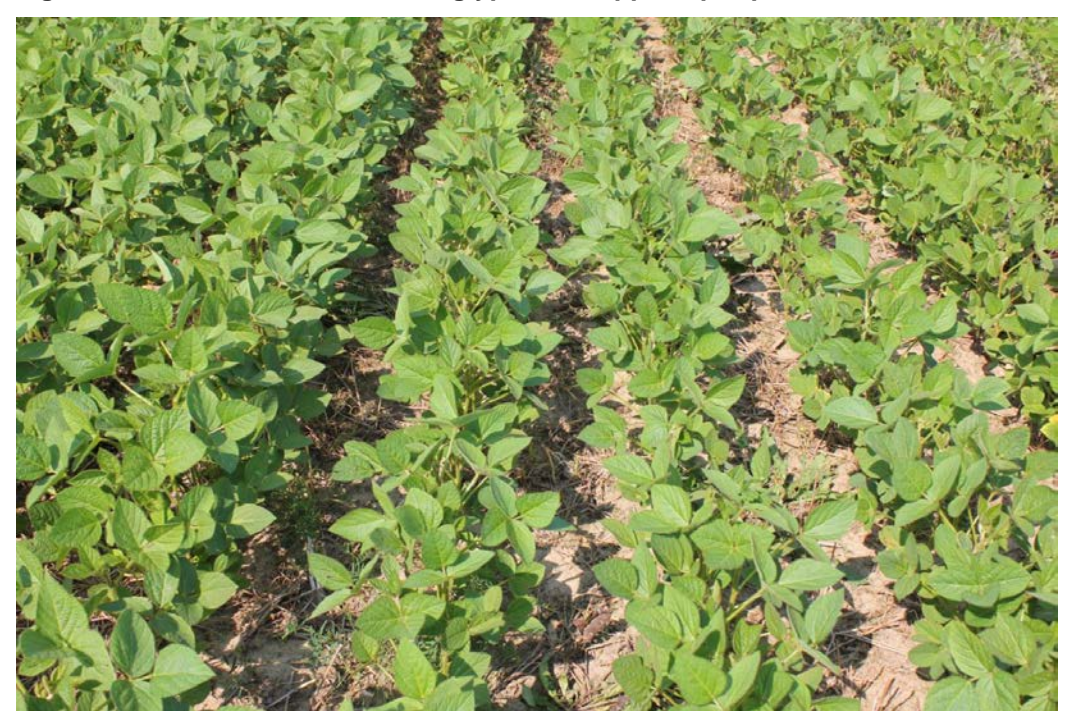
Figure 3 Tufted vetch control with glyphosate + 2,4-D Ester 700 applied pre-plant