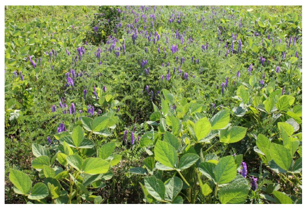
Figure 2 Tufted vetch control with glyphosate applied pre-plant