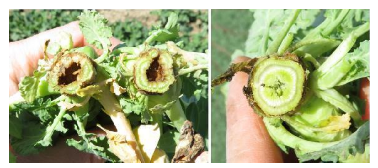
Figure 2. Plants cut at the soil surface in spring to assess plant health. The two plants on the left have damaged vascular tissue (hollow stems) and have very low yield potential. The plant on the right has a small amount of damage but is healthy, with good yield potential. Levels of damage in between those shown above will have to be carefully evaluated and it may be appropriate to reduce the amount of spring nitrogen fertilizer to meet yield potential.

Heavier soils generally had greater stand loss with the wet conditions in spring of 2019. Heaving was observed in patches in a few fields that have heavier soils, and in some cases the plants were completely ejected from the soil. Plants also had a greater level of damage inside the stems (hollow, rotten vascular tissue) on fields with heavier soils. It is important to cut plants at the soil surface and assess plant health as well as population in the spring. Fields with plants that have highly damaged vascular tissue and hollow stems should be terminated because the plants cannot transport water or nutrients and therefore have low yield potential (Figure 2). Cutting stems is important because plants that have very limited yield potential may appear healthy and green on the exterior in spring. Fields with minor damage inside plant stems may have slightly decreased yield potential and investment in spring nitrogen should be scaled back.