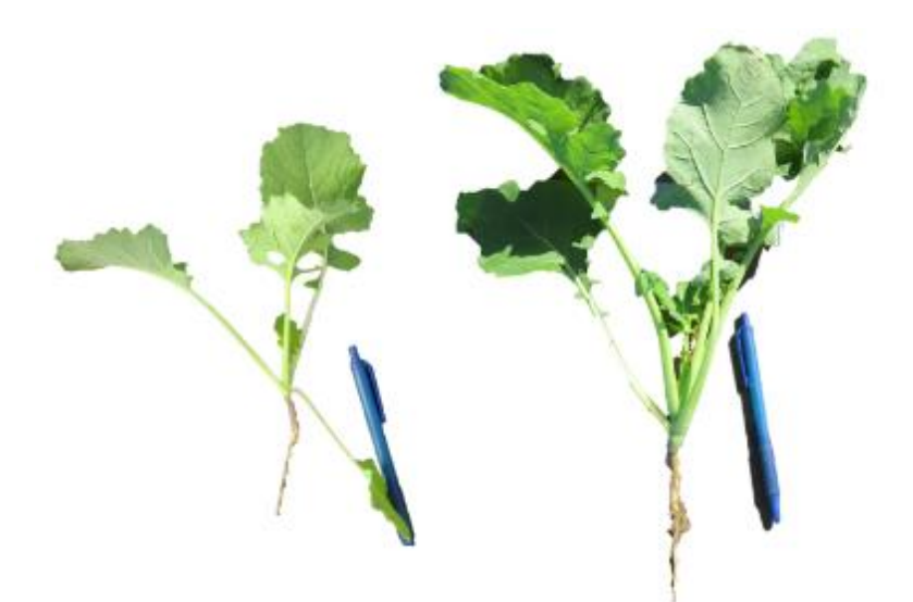
Figure 1. Canola plants should be at 4-leaf stage (left) to 6-leaf stage (right) prior to a hard frost in fall. Plants are shown in comparison to the size of a pen.

The target population for winter canola should be 5 to 8 plants/ft<sup>2</sup> or approximately 250,000 plants/ac. However, canola has a strong ability to branch and fill in at low populations. An even stand of healthy plants at 2 or 3 plants/ft<sup>2</sup> in the spring can achieve yields similar to stands of 5 to 8 plants/ft<sup>2</sup>.