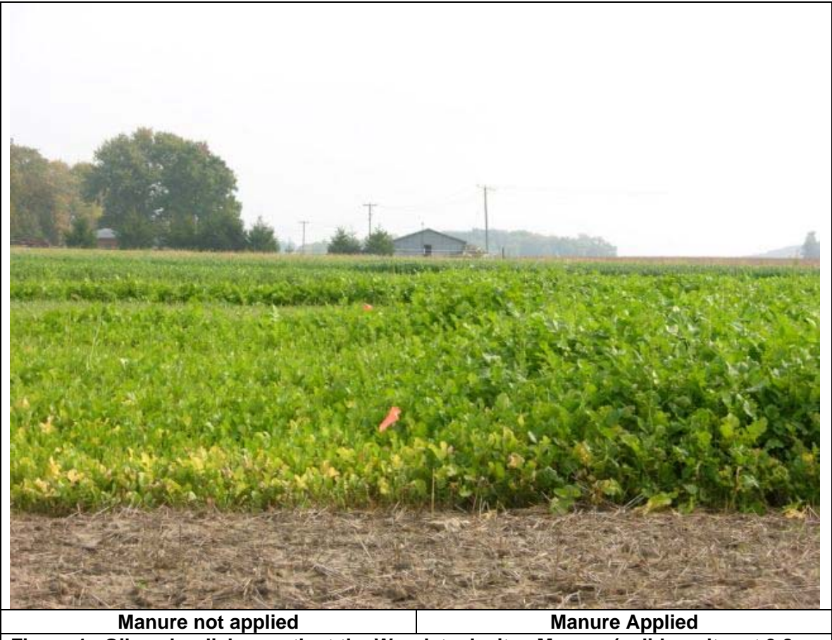
Figure 1. Oilseed radish growth at the Woodstock site. Manure (solid poultry at 3.8 tonnes per acre) was applied and incorporated with tandem disc. Cover crop planting date was August 10, picture taken October 3, 2006.

Where manure was applied, end of season Oat and Oilseed radish yield averaged about 4500 kg/ha whereas the pea and ryegrass yields averaged about 3300 kg/ha. Red clover growth was unaffected by manure application, with above ground yields by November reaching about 3000 kg/ha.