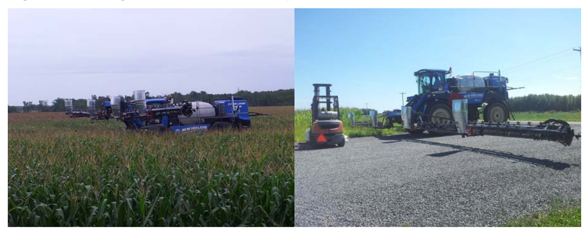
Figure 2. Seeding Methods for Cover Crops

Simple spinner spreaders were attached to the boom of a New Holland SP275f sprayer equipped with 4 wheel steering to minimize headland trampling loss. 6 seeders were purchased but for the purposes of this experiment but only 4 were installed. 2015 will see all six seeders incorporated into the design. Time constraints and a concern about weight limited the project to 4 seeders for 2014. The attachment of the spinner spreaders to the boom was designed to allow the spacing between spreaders to be adjusted based on the density and characteristics of the seed being applied. For this experiment 16ft spacing gave excellent well distributed coverage during pan testing. For the range of species adapted for Eastern Ontario this spacing should work for most. The sprayer itself is a front mounted boom machine with over six feet of clearance making it ideal for travelling through full height corn. The boom easily keeps the spreaders well above the canopy to maintain even spreading across the entire width of the machine.