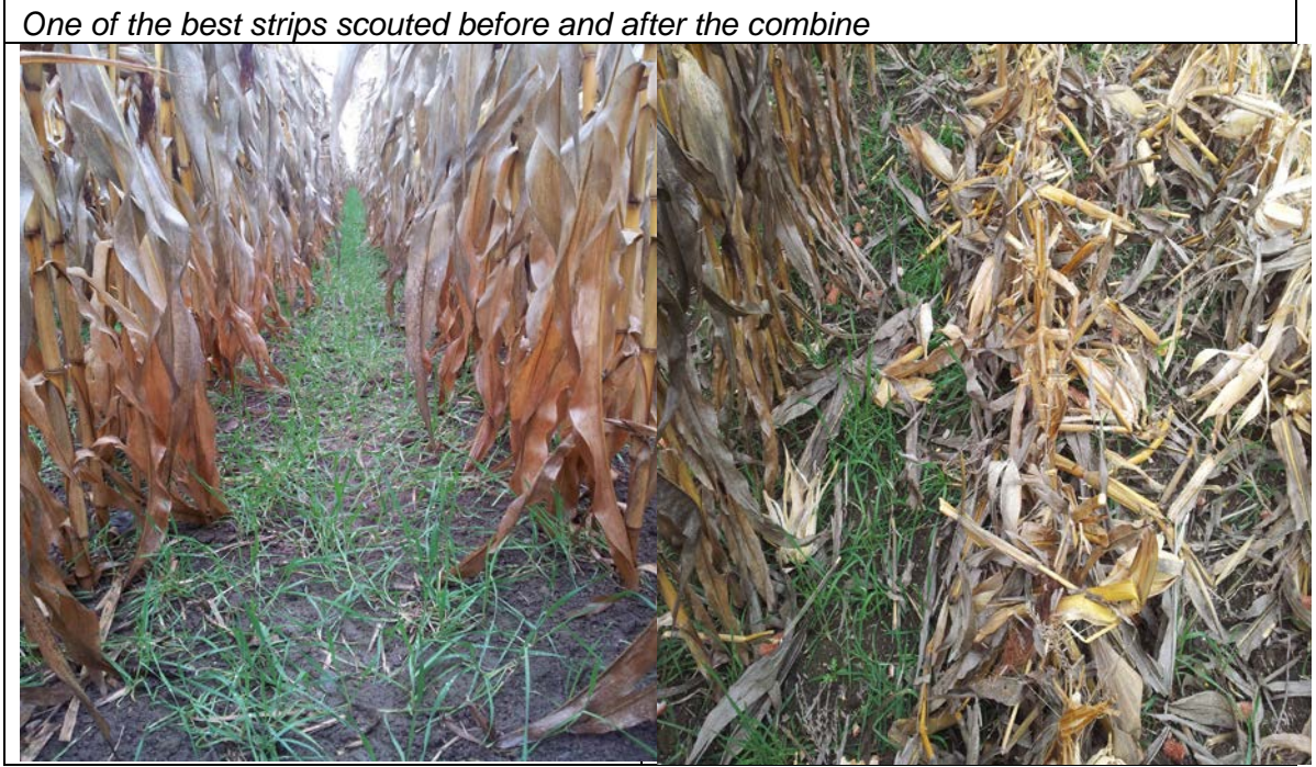
Figure 4. Cover Crop Establishment Success in Standing Corn