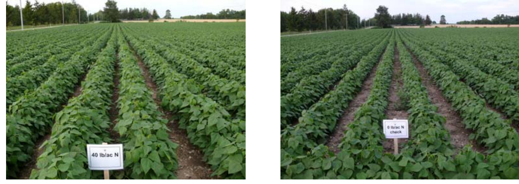
40 lbs/ac N

Figure 3: Visual Response to Nitrogen in Dry Beans, August 1 (Thamesford)