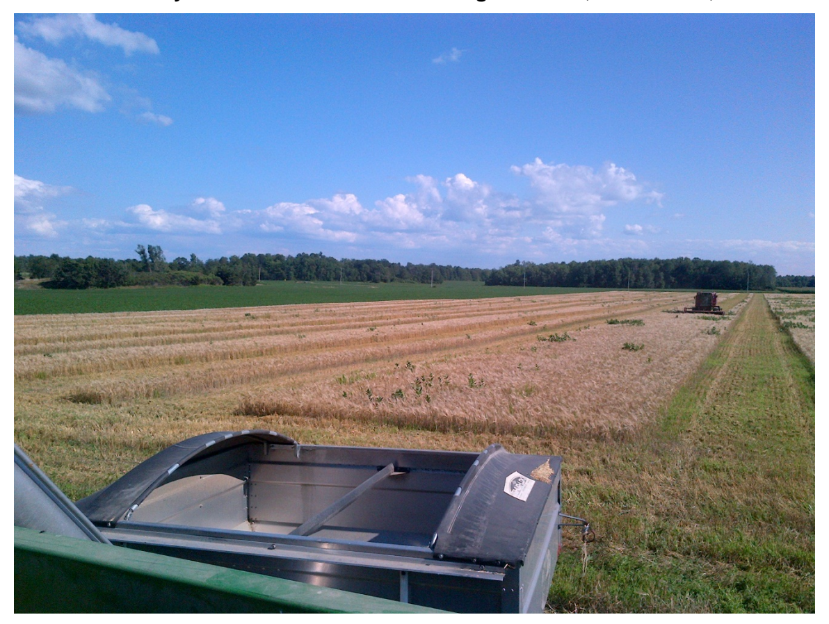
Picture 1: Plot layout and harvest of trial - George Webster, Lansdowne, ON

At harvest, grain weights were collect and moisture measurer to adjust yield. Test weight was measured and grain samples were collected and analyzed for toxin levels (VOM ppm) for quality.