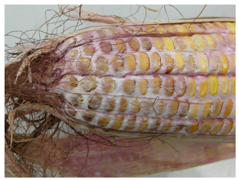
Figure 1. Close Up of Corn Ear Mould

As in previous years, the OMAF and MRA Field Crops team completed a survey of the 2013 Ontario corn crop to determine ear mould incidence as well as the occurrence of mycotoxins in the grain. These mycotoxins, particularly vomitoxin (DON) produced primarily by Gibberella/Fusarium ear moulds can be disruptive when fed to livestock, especially hogs. The purpose of this annual survey is to increase our understanding and access industry risk.