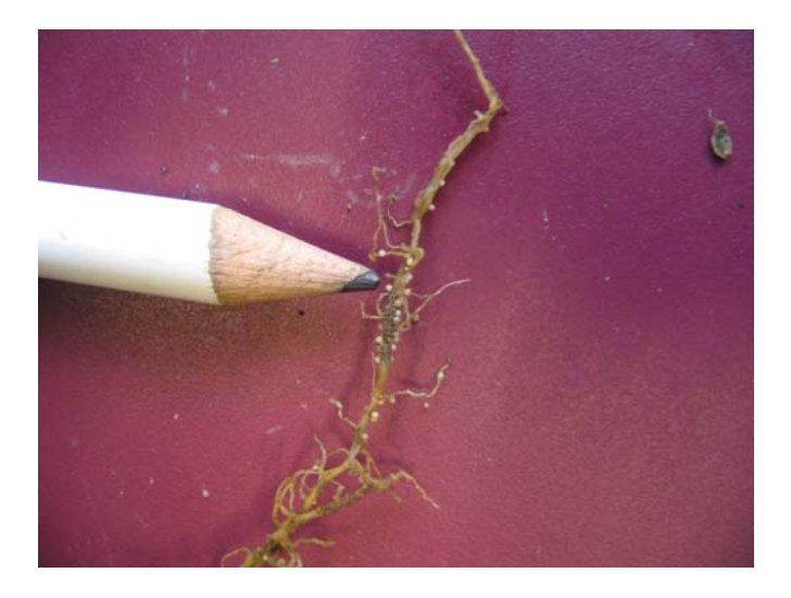
Figure 1. Soybean Cyst Nematodes on a soybean root. Note that they are much smaller than soybean nodules.

SCN causes the greatest yield losses of any single pathogen to soybeans in the world, causing up to 40% yield losses even before above ground symptoms are evident. SCN is a serious soybean pest that limits yield in many Ontario fields. It was first identified in Southwestern Ontario in 1988 and continues to spread into new soybean growing areas. It has now been verified as far east as Quebec (2013) and has spread north. SCN is known to be present in Huron county, however it's distribution and severity within the county are not well known. Many Huron county soybean growers do not recognize that SCN may be significantly reducing yields on their farms. Some growers consider SCN to be a problem limited to southern counties. Unfortunately, this is no longer the case.